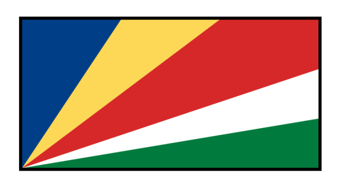
Flag of Seychelles

The largest lake in Africa is Lake Victoria and the longest river is the Nile River, which is also the longest river in the world.