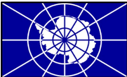
Antarctic Treaty Flag

Prior to 2002 Antarctica had no official flag. The members of the Antarctic Treaty System officially adopted a flag and emblem in 2002, which is now the official symbol of the continent. Whitney Smith and Graham Bartram have designed flags they would like Antarctica to use.