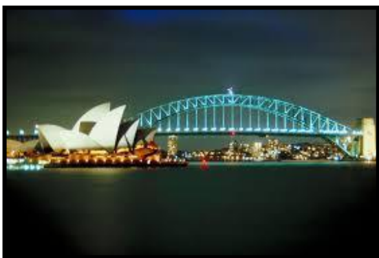
The opera house in Sydney, Australia.