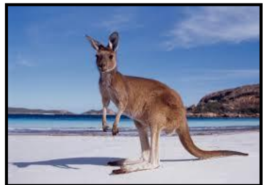
A kangaroo hops along the beach of Australia.