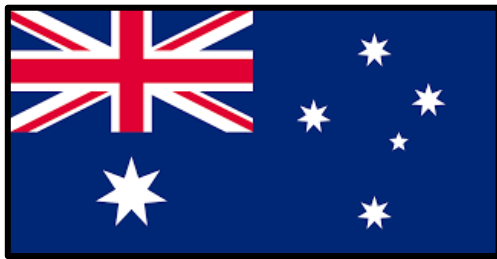
Flag of Australia

Australia is located in the southern hemisphere. This means that it has winter during June, July, and August and summer during the months of December, January, and February.