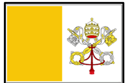
Flag of The Vatican