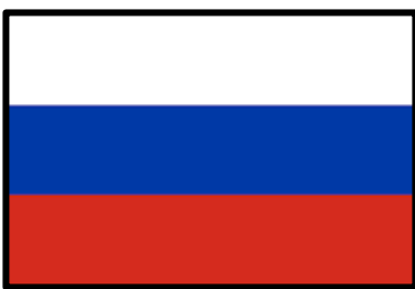
Flag of Russia

The Industrial Revolution began in Europe in Great Britain.