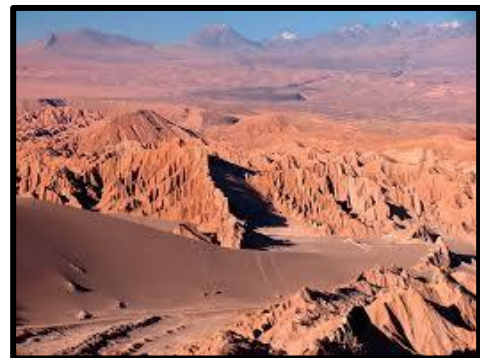
The Atacama Desert