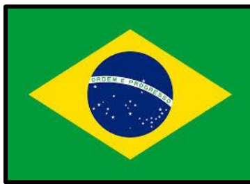
Flag of Brazil