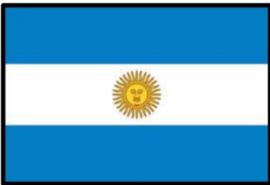
Flag of Argentina

The Atacama Desert in Chile is considered to be one of the driest places on Earth.